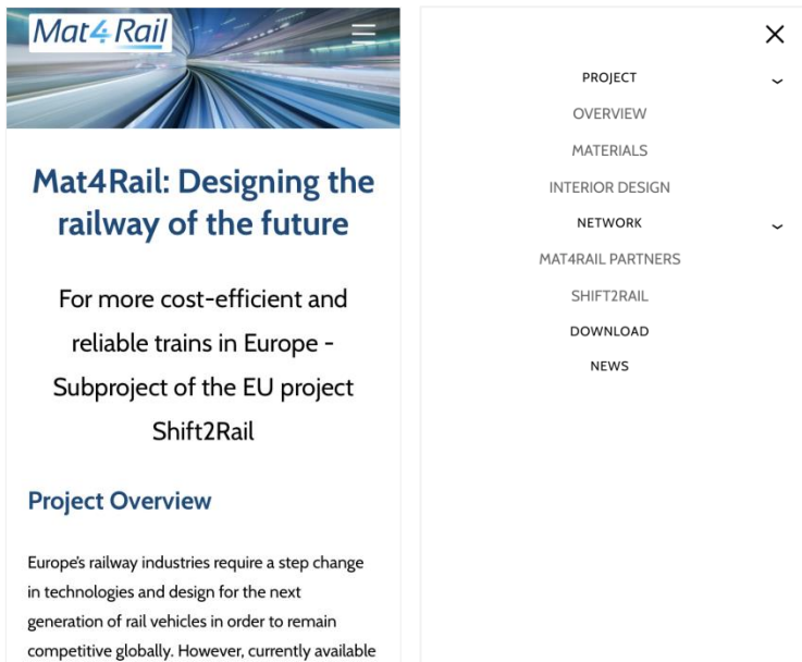
Figure 3: Responsive design – Website displayed on a small screen (tablet or smartphone), the left image shows the website and the right image shows the navigation menu.

The website has been created with the online website creating tool Weebly ( www.weebly.com ). The tool works mostly via drag-and-drop, offers flexible and professional layouts and easy integration of interactive features like blogs and forms. By default, it also offers responsive designs, i.e. website layouts that adapt to different screen sizes. Since Weebly offers only a limited amount of layout options, other companies like webfirethemes sell templates that can be imported in Weebly .