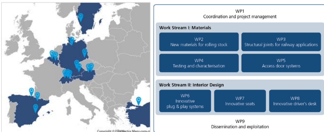
Figure 5: Map to visualize partner locations (left) and PERT chart as visual aid to explain work streams (right).

To make the website more appealing, images and graphics have been used to illustrate given information. This includes using logos for Partner Organisations, photos of team leaders, charts e.g. to explain processes, and image material for the headers. The graphics used on the website have been received from different Partner Organisations or created explicitly for the use within the Mat4Rail project (e.g. charts). The header image was purchased from Shutterstock for use in the project.