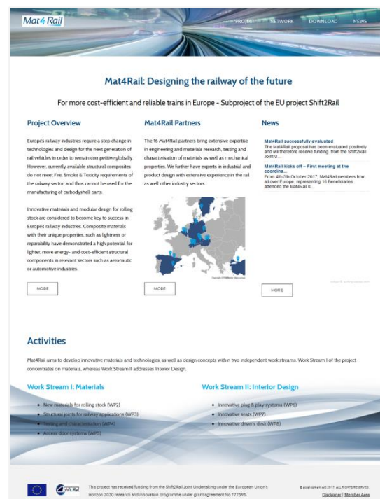
Figure 1: Mat4Rail Website (Landing page)

The information displayed on the Mat4Rail website will be continuously updated and added to in order to complement the given content with new results.