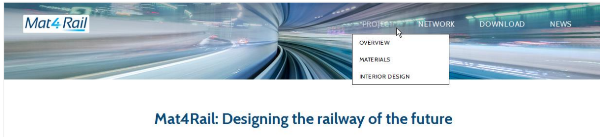
Figure 2: Navigation of Mat4Rail website.

The website is currently structured as follows in order to support the above goals. However, this structure and the web pages will evolve over time and be adapted as the project develops.